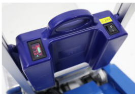
Portable Rechargeable Lithium Battery Plug&Play, Eco-friendly