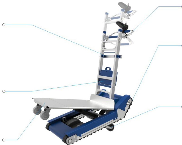
Multiple Handler Extend For Height Adjustment, Rotation For Title Angle Adjustment