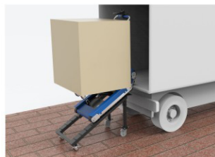
Electric Mini Lift ELS420

Size: 1050x687x633MM Load Capacity: 520KG Net Weight: 19.6KG Rise of Loading Board: 600-800MM