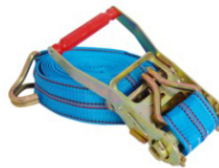
Adjustable Safe Strap