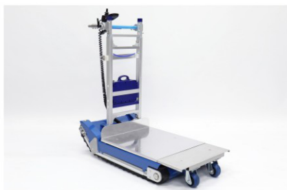
Pushing On Flat Surface