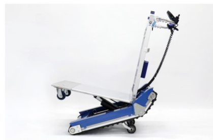
Support Wheel Extend On Last Staircase