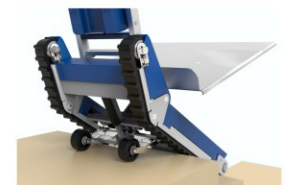
Auxiliary Support for Last Staircase Design Full Remote Operation, No Labor Intensity