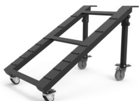
Ramp Accessories ZX400

Size: 1050x687x633MM Load Capacity: 520KG Net Weight: 19.6KG Rise of Loading Board: 600-800MM