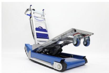
Loading Board Adjustment