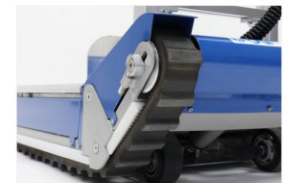
Non-slipping & Non-marking Crawler Track